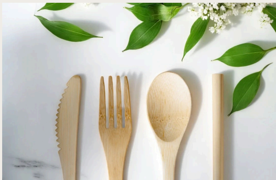
straw, spoon & fork